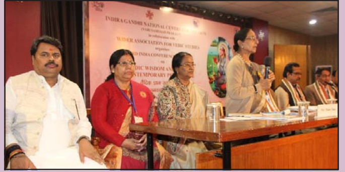
Judges on the Dias