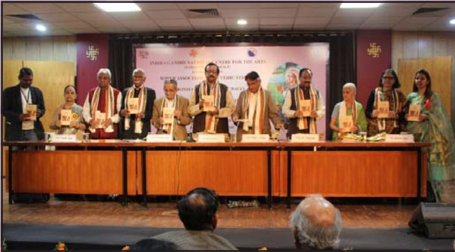
Release of Books