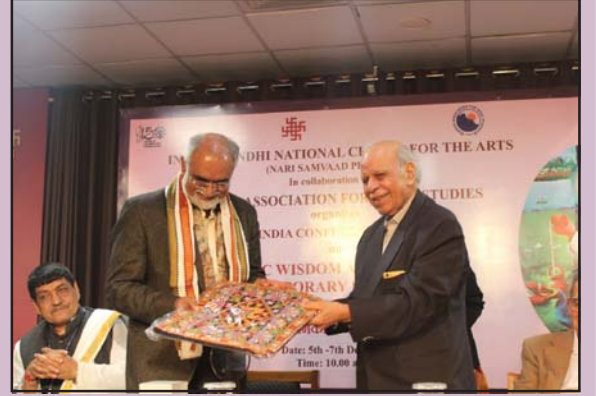
Welcome of MS, IGNCA