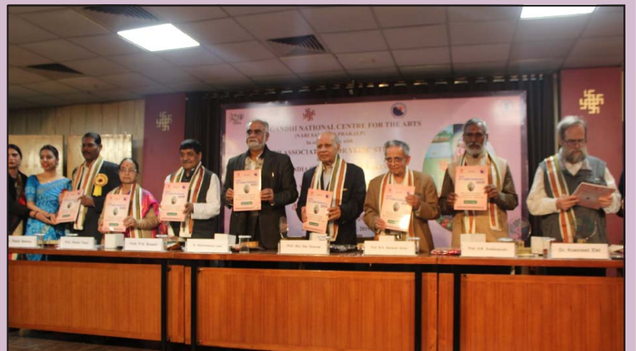
Release of Souvenir