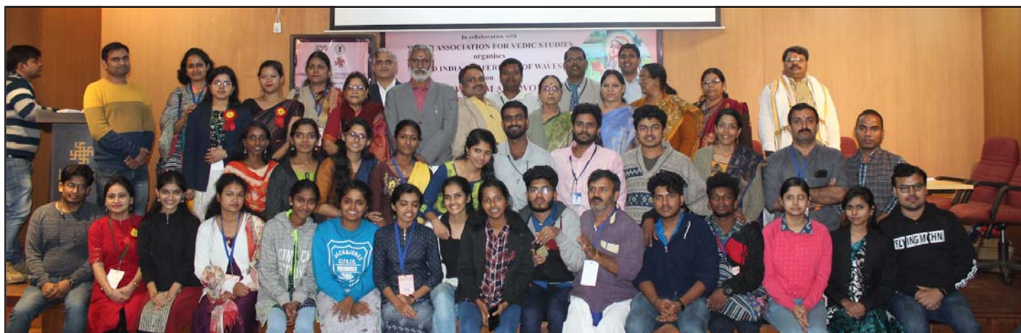
Delegates from Kerala in Young Researcher's Session of 23rd India Conference