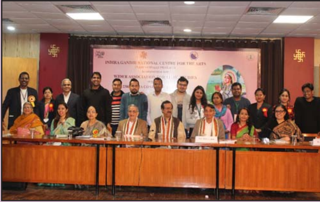
VIPs with Volunteers

conference, members of WAVES, and especially to the authorities of IGNCA for their support to this big academic event. The conference concluded with the recitation of Shanti Mantra .