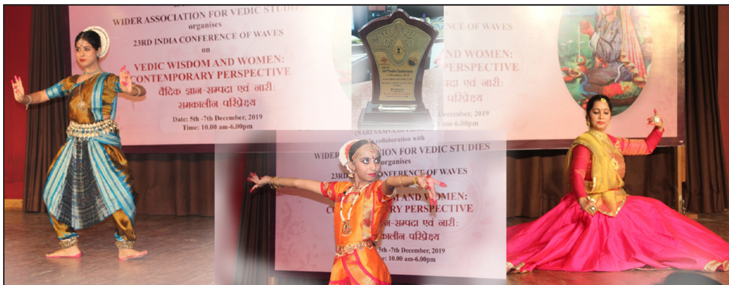
Cultural activities at Evening of 23rd India Conference