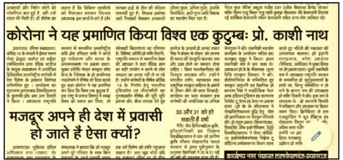
Our News in Newspaper