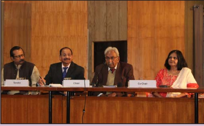
Session in Auditorium