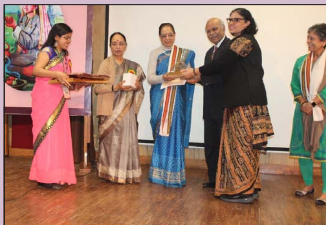
Felicitation of Scholars