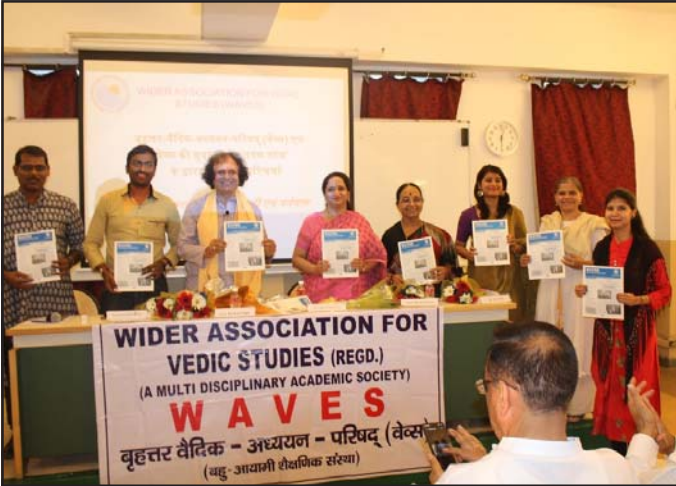
Release of Newsletter-2019