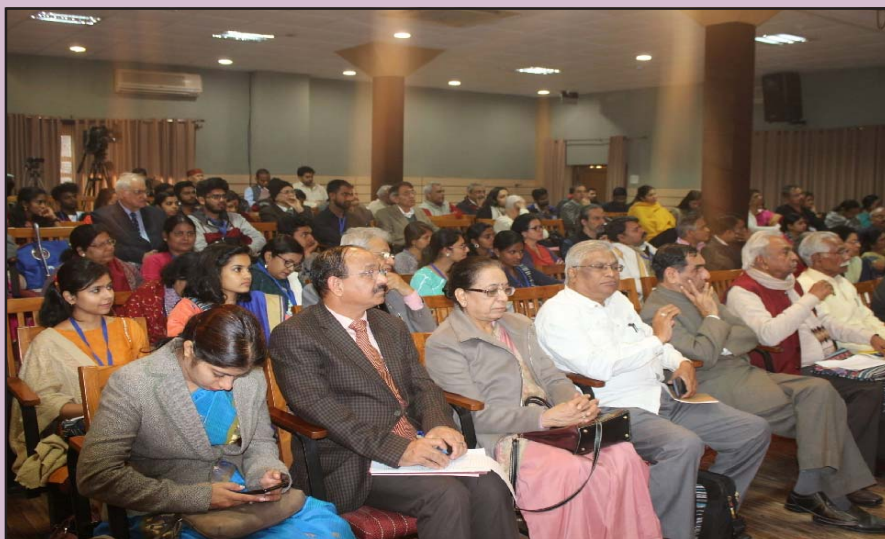
Scholars and Audience

Devi Draupadi: The Exemplar of eternal Vedic Liberalism and Gender Parity