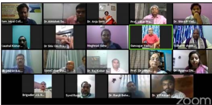
Grid view of attendees during Webinar