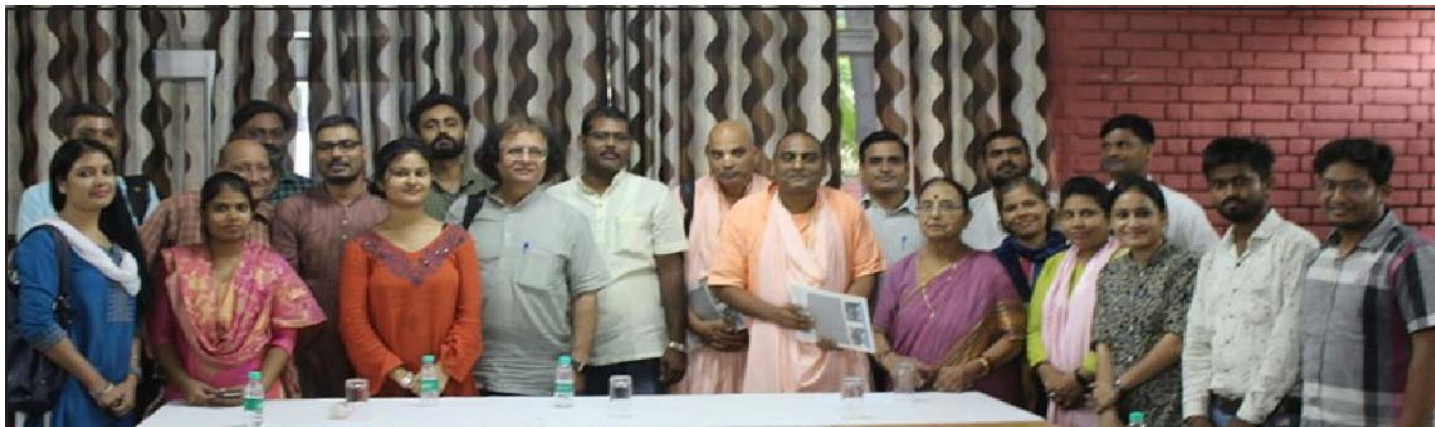
Speakers with Audience