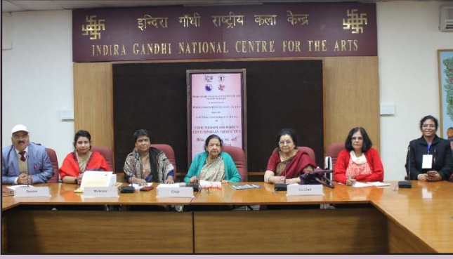
Session in Conference room

conference, members of WAVES, and especially to the authorities of IGNCA for their support to this big academic event. The conference concluded with the recitation of Shanti Mantra .