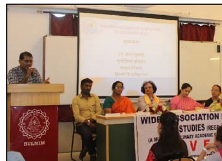
Speakers & Chairperson on Dias