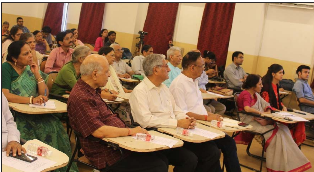
A View of Audience