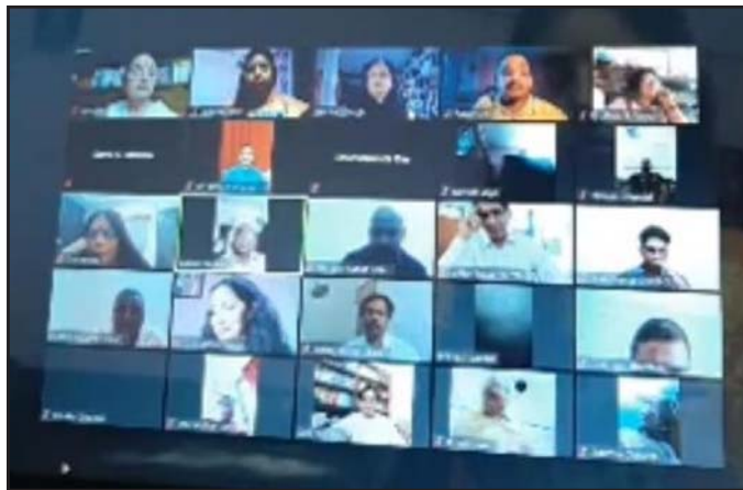
Grid view of attendees during Webinar