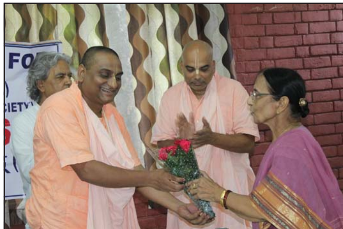
Welcome of the Chief Speakers