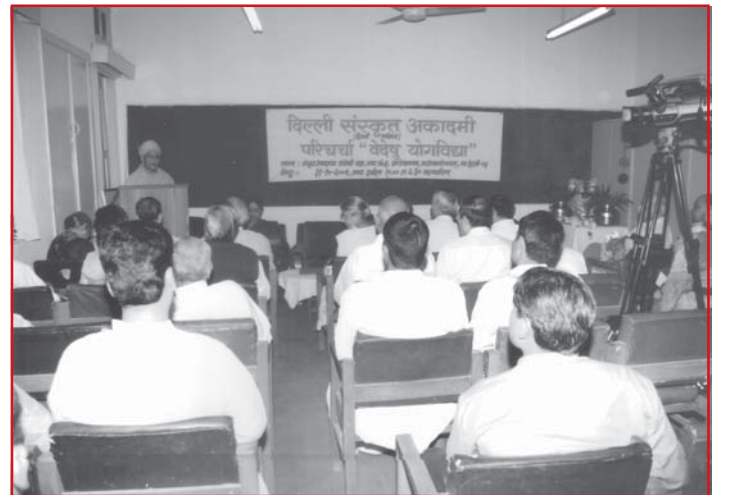
A View of Audience in Academy Hall