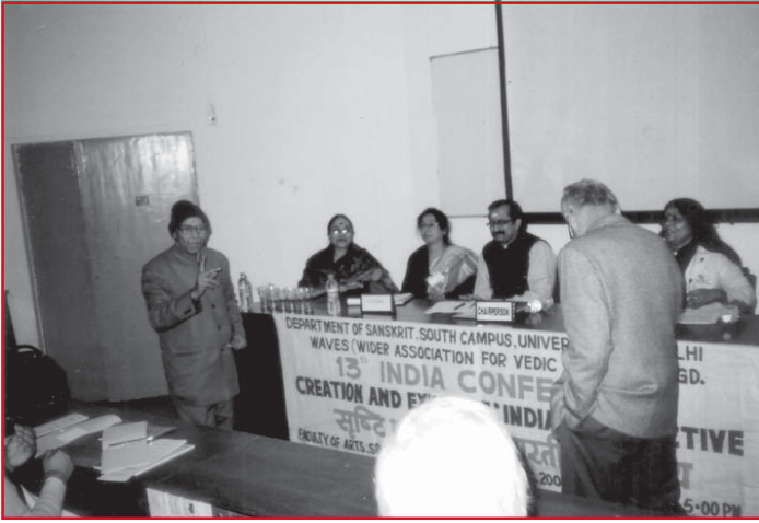
Scholars interacting in the 13th India Conference