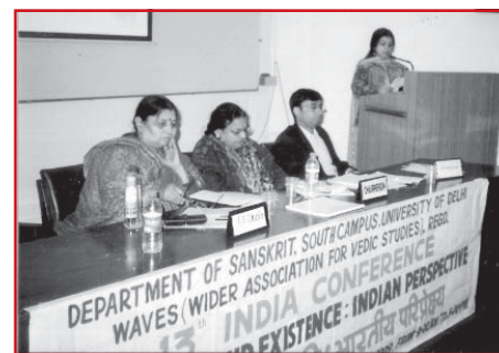
Student Session in the Conference