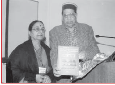
Release of Second Publication of WAVES by Chief Guest

the creation has been a major point of discussion. This world is in the form of extension of Brahman . It has no beginning and no end.