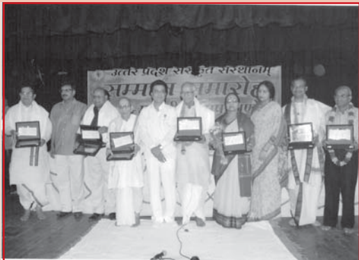
Honour by UP Sanskrit Sansthan