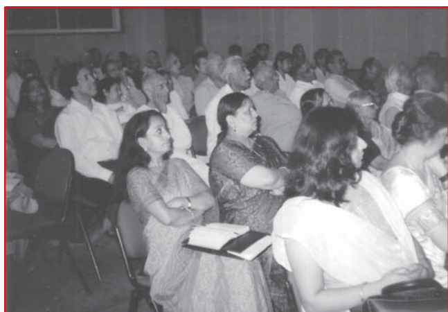
A Section of Audience on 06-04-2009